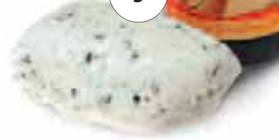
Pyramid Apricot Weizen (Pyramid, Seattle) with herbed goat log: A gold-medal winning fruit beer, this smooth wheat ale has an apricot flavor and aroma. The pepper in the goat log lent a spicy note, making it a good foil for the fruity beer. Good with aged as well as fresh goat cheeses, and maybe even a pepper jack. $5.99/ six-pack. Goat cheese log, $15.95 per pound.