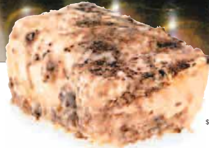
Maudite (Unibroue, Canada) with Deep Ellum Blue: More complex, spicier and higher in alcohol content (8 percent) than most beers sampled. This rich-tasting, strong-character red ale stood up well to the mild blue-veined cheese. Roasted malt and high alcohol content make it a substantial beer that pairs well with strong-flavored cheese. Best served cool, not cold. $6.49 for 750 ml, $8.99/four-pack. Deep Ellum Blue cheese: $15.25 per pound.